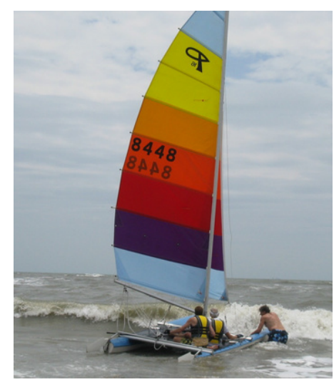
Launching Blew By You -16ft Prindle - with Guy's Dad on the boat