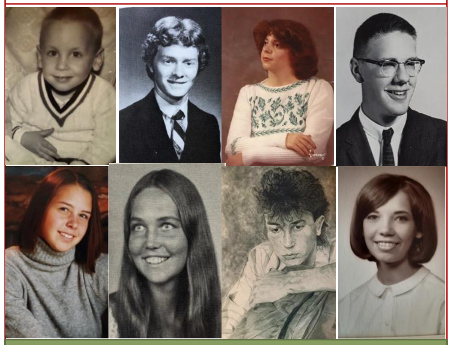
Who are these HSA sailors? This is how they looked in high school, except the one in the upper left. (Unless he was some kind of prodigy.) (Probably not! HA!) We'll put them on Facebook unless someone objects and tell you there who's who.