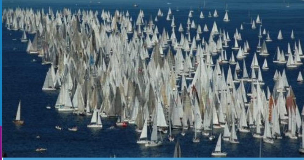
The Mercy pg. 3

Sooooo many sailboats! The Barcolana Regatta off the coast of Italy is a 15-mile, four-sided course race that celebrated its 50th anniversary last October. Over 2600 sailboats and 16,000 sailors being watched by a quarter of a million people on shore.