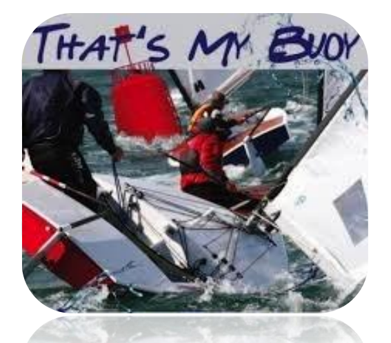
It may not look like this, but it will be fun. Six marks, 600 acres, and a lot of zig-zagging.

It was on the calendar last year. It just never happened, due to poor wind and weather. But this is 2018, and we are determined to pull it off this year. Grrr!