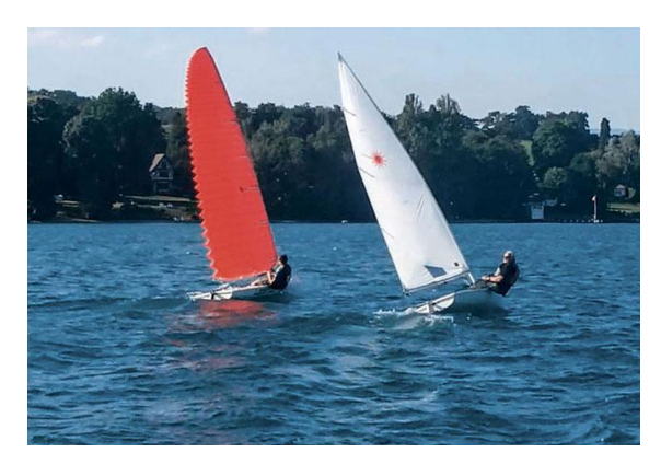
An IWS sails along side a Laser

No, we didn't crop the picture above left. You are seeing the retractable, telescoping mast raise the sail. No halyards, just push a button and the mast rises while the wing shaped sail inflates. All hydraulics.