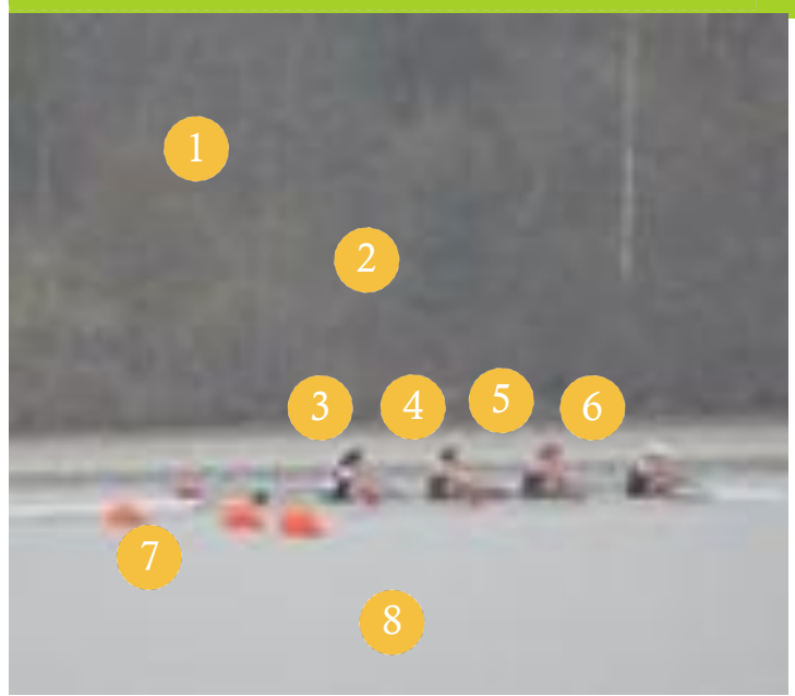
Above: 1. Rain 2. Leafless trees 3. Bow rower 4. Fuel tank 5. Engine room 6. Stroke rower 7. Lane markers 8. Water being added to by the minute.

Below, an eight man shell with, uh, nine people. The guy in the back just watches to make sure no one is goofing off.