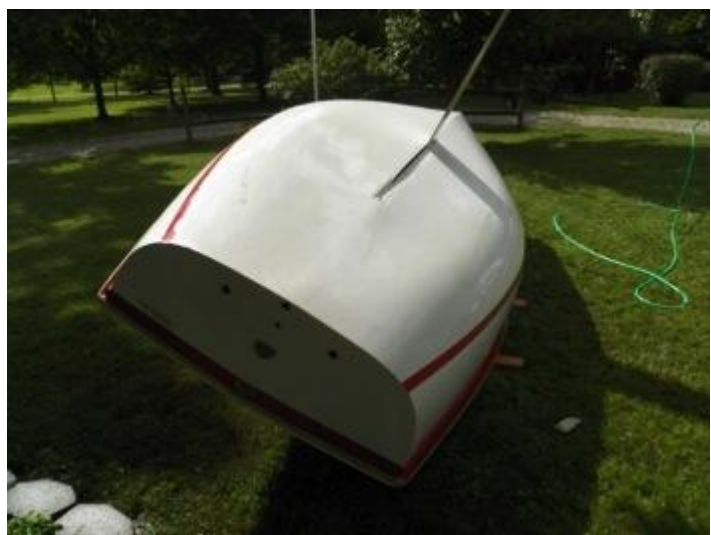
The two pictures on top are of the new club Capri before the cleaning began. Above is the bottom after cleaning and polishing and at left is the boat at the lake last Sunday looking pretty darn spiffy.