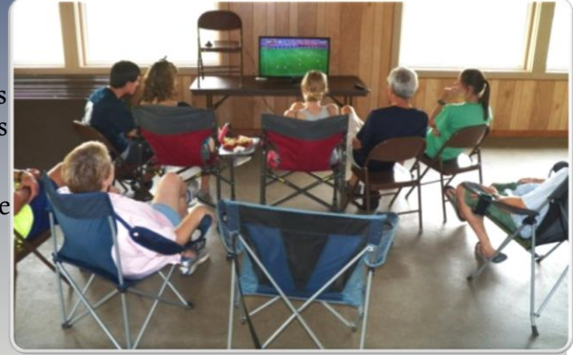
Potluck turns into World Cup as HSA watches U.S. women turn back the Japanese attack.

A clear night, slight cool breeze, no mosquitoes, good friends. Priceless. The sound of the aerial bombs echoed long and hard into the surrounding hills and then faded. The memories, however, still reverberate.