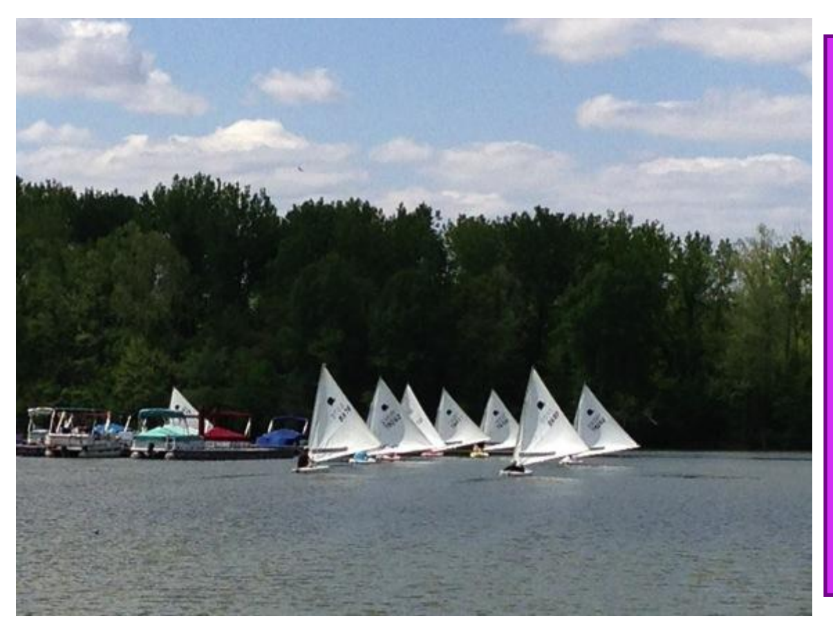
Photo at left is a picture from Jenny Deaton who was on the committee boat and got this shot of the Sunfish fleet coming in yesterday after an afternoon of competition.

Winds were inconsistent at best and challenged young and old alike. Races 1 and 3 were light while race 2 saw a stiff breeze from start to finish. Hello, Acton Lake!