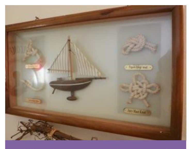
While staying in a cabin at Indian Lake recently, Jerry Brewster and family found this display on the wall. But on a closer look they discovered a knot new to them: a "Figure Eihgt", probably a Gaelic word that means "The Knot of the Granny". We're guessing.